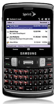
Samsung Intrepid (SPH-I350)