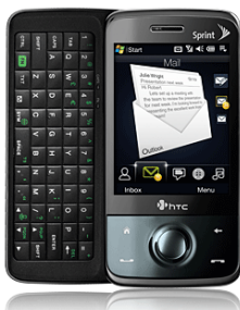
HTC Touch PRO™