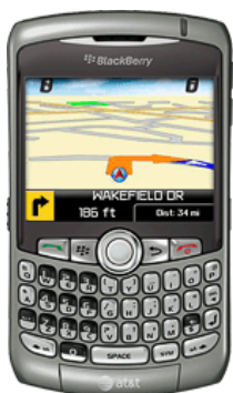
BlackBerry® Curve 8320