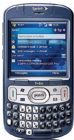
Palm Treo 800w