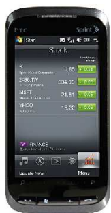
HTC Touch Pro2