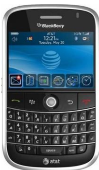
BlackBerry® Bold 9000