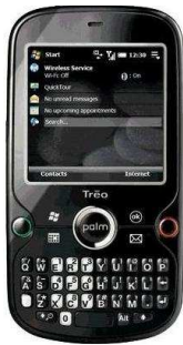
Palm Treo Pro