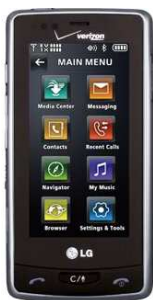
LG VX9600 (Versa)