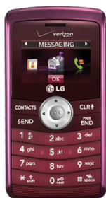
LG VX9200 (enV3)