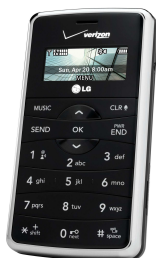
LG VX9100 (enV 2 )