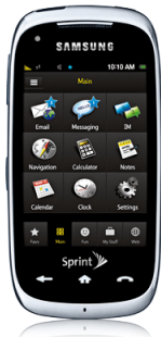
SamsuSamsung Instinct® HD (SPH-M850)